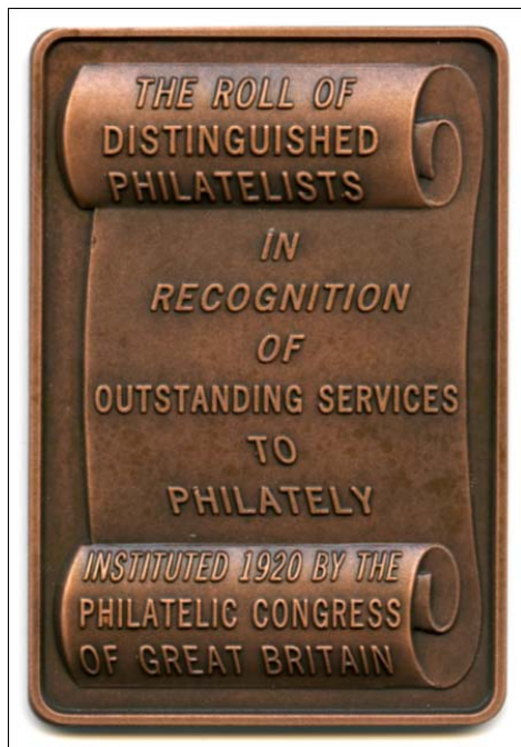
O: The RDP Placquette awarded to every Signatory