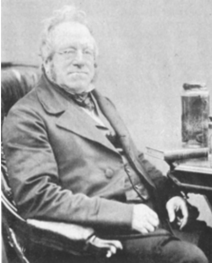
S: Dr John Edward Gray FRS 1800-1875

One of these is Dr John Edward Gray FRS of Great Britain who was born on 12 th February 1800 and died 7 th March 1875. He prepared one of the first stamp catalogues in English in 1862. This is the furthest back that we can take the history of the Roll.